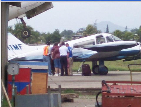
Carefully loading the air-ambulance passenger in Cap Haitian, Haiti

I had just returned to work after a long flight the previous day, and was asked the question, "Do you feel up to flying again to Haiti today for an emergency flight?" I was the only pilot available and, thankfully, was able to get plenty of rest after the flight the previous day. I took off around 9:45am from Fort Pierce, FL, and landed in Haiti mid-afternoon. The lady I was to transport had broken her artificial hip and was in severe pain, so we were praying for a smooth flight home. We brought a gurney with us in the plane, so she was fairly comfortable for the 4 hour journey back to Florida. Things went well and we arrived in Palm Beach around 8:25pm and were met by an ambulance. It is a blessing for the missionaries to know that help is only a few hours away if they need us. Praise God for continuing to provide for this much needed Emergency Fund, as it is very costly and the missionary can't always cover the costs involved.