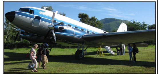
The grass airstrip at Pignon